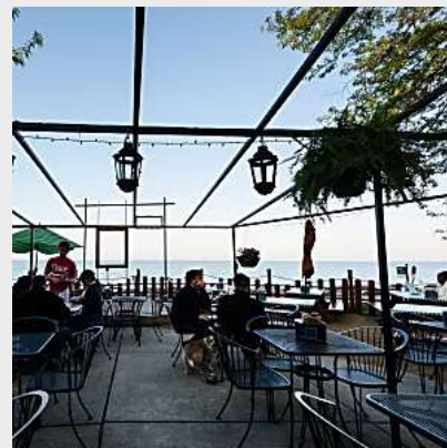
The best waterfront dining spots in Chicago ( http://www.timeout.com/chicago/restaurants/5-unexpected-spots-for-waterfront-dining-in-chicago )