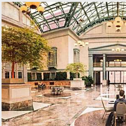
Chicago events calendar for 2017 ( http://www.timeout.com/chicago/events-calendar )