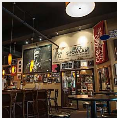
Jazz Showcase ( http://www.timeout.com/chicago/music/jazz-showcase )