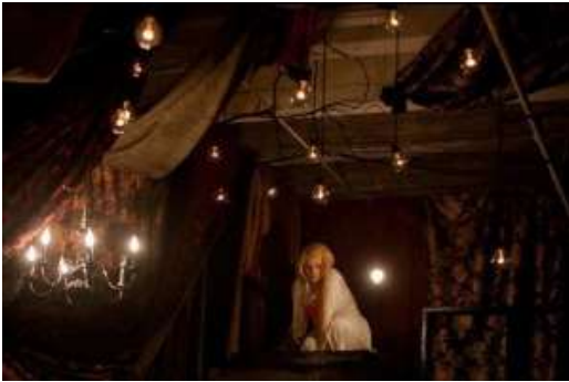
( https://storefrontcity.files.wordpress.com/2013/04/tsl_anthonylapenna6.jpg)