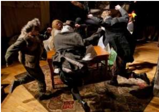
( https://storefrontcity.files.wordpress.com/2013/04/tsl_anthonylapenna2.jpg)