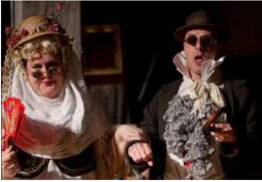
( https://storefrontcity.files.wordpress.com/2013/04/tsl_anthonylapenna8.jpg ) (Photo by Anthony La Penna)